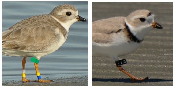
Green band – Atlantic US, Black band – Atl Canada All photos taken on Seabrook North Beach

Piping Plover bands are placed in various configurations on upper and lower legs. Flag/band colors define breeding area, and/or where bird was banded. Wintering Seabrook Piping Plovers are mostly spotted from Great Lakes, Atlantic US & Canada breeding areas.