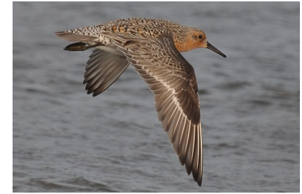
Red Knot, North Beach

Red Knots have one of the longest migrations of any bird, 18,000 miles round trip from the tip of South America to the Arctic where they breed. From March to early May, Seabrook Island is an important stopping point for them to feed and rest on their long journey north to breed.