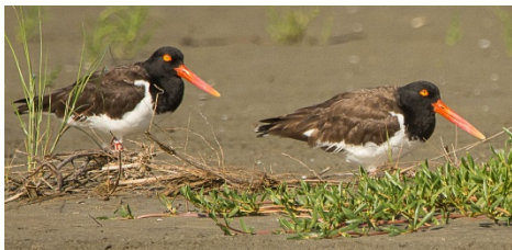
American Oystercatcher, North Beach