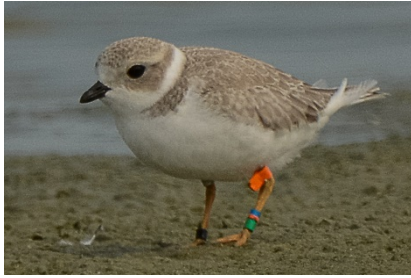
Piping Plover, Orange band - Great Lakes

Piping Plovers breed at Great Lakes, Atlantic, and Great Plains areas from April to July. In late July they migrate to southern coasts and Caribbean to winter until next spring. Seabrook is an important wintering & migratory site. Quality foraging & roosting habitat on winter beaches is key for adults to survive and return to breeding sites.