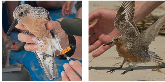
SC DNR Red Knot banding on Seabrook, Orange band – Argentina, Green band - SC

Banding tracks an individual bird to study the entire life-cycle - where they go, how long they live, what resources are needed for survival. During Red Knot migration on Seabrook, SC DNR teams apply new and identify existing bands, and place/retrieve geolocators and nanotags which provide data on movement.