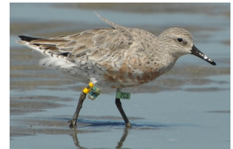
Red Knot with geolocator, North Beach

Seabrook Island has one of the largest single flocks of Red Knots in US, with thousands seen at a time during peak in Apr-May. Knot population on East Coast has declined 85% since 1980. Knots are "Federally Threatened" under the US Endangered Species Act.