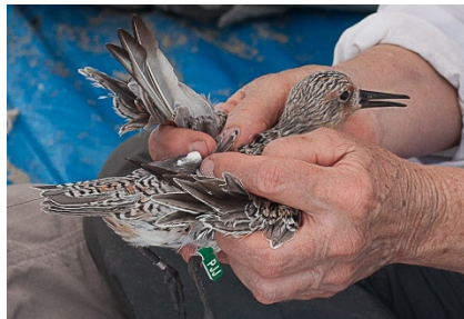
SC DNR placing nanotag for tracking

Banding tracks an individual bird to study the entire life-cycle - where they go, how long they live, what resources are needed for survival. During Red Knot migration on Seabrook, SC DNR teams apply new and identify existing bands, and place/retrieve geolocators and nanotags which provide data on movement.