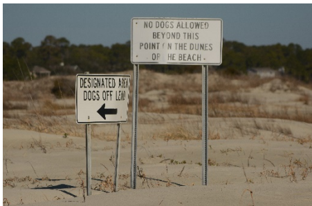
Town of Seabrook Ordinance. Subject to fine.

When off leash, dogs must be under voice control.