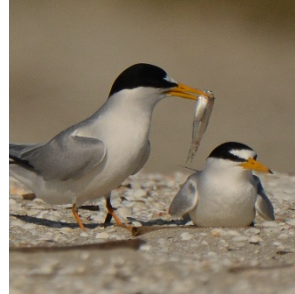
Wilson's Plover & Least Tern, North Beach