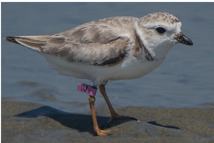
Piping Plover, Pink band – Bahamas

Populations and breeding habitats have drastically declined. Development, people, dogs, predators, weather, and environment are serious threats. Great Lakes area Piping Plovers are "Federally Endangered". Atlantic area are "Federally and SC Threatened".