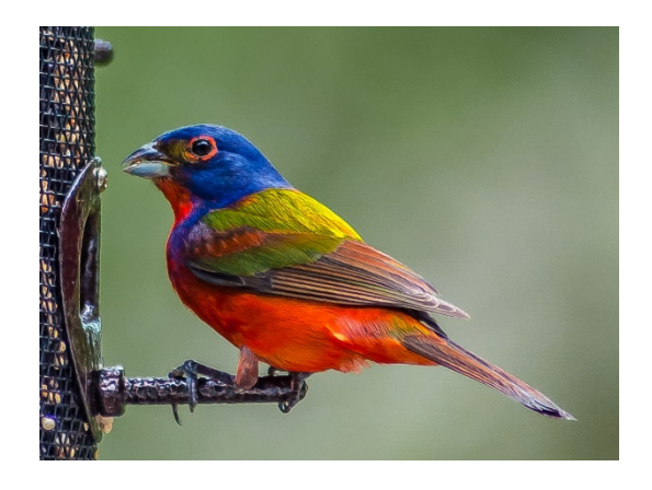
Painted Bunting, SI Backyard