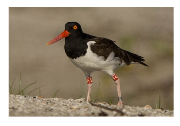
American Oystercatcher, North Beach

Seabrook Island Birders are residents, renters and guests of Seabrook Island, SC who have an interest in learning, watching, and protecting the incredible variety of birds and habitats that are on Seabrook Island.