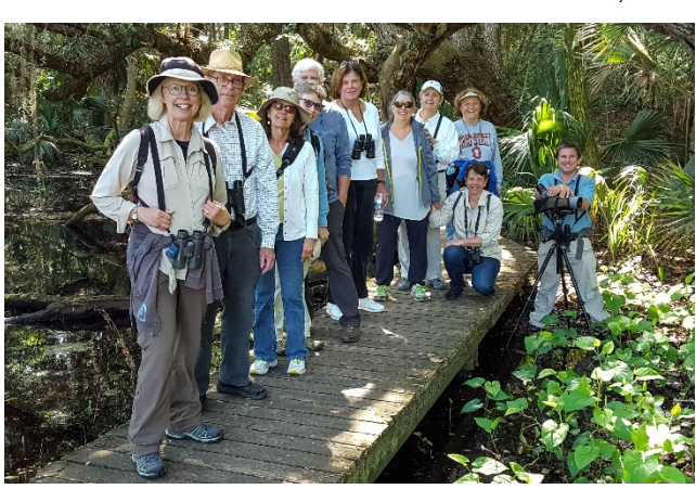
Bird Walk, Camp St Christopher