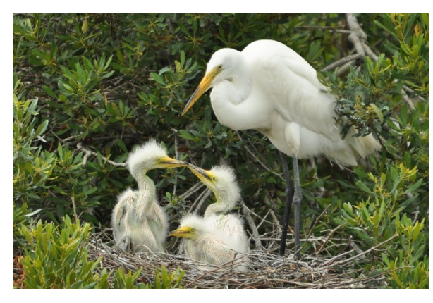
Great Egret, Jenkins Point