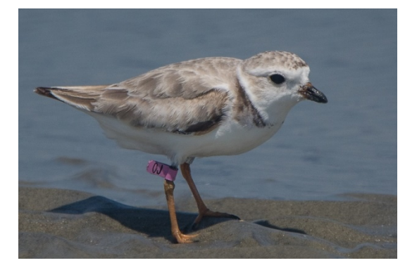
Piping Plover, North Beach

The north end of Seabrook Island beach is designated by US Fish & Wildlife as a Critical Habitat, essential to bird species that need special protection. Piping Plovers, an "Endangered" species, migrate here in winter. Our "Threatened" species are migrating Red Knots. and nesting Wilson's Plovers & Least Terns